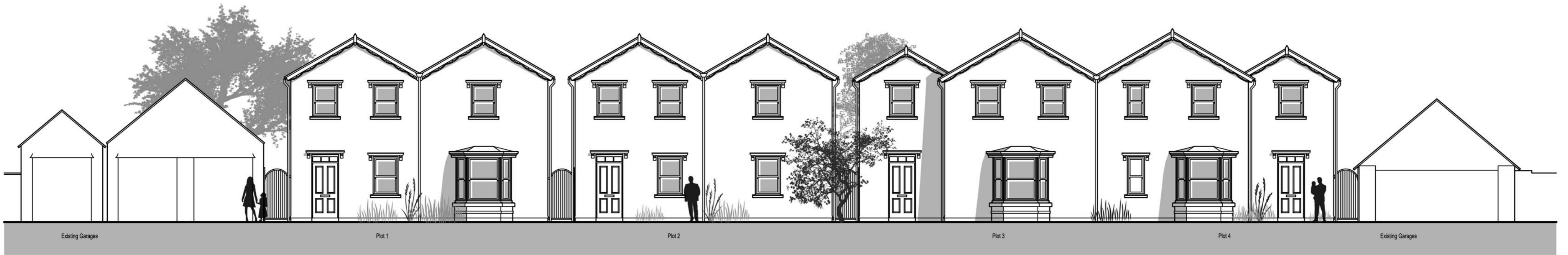
Street Elevation A-A Scale 1:100

Copyright is retained by Big Picture Design.